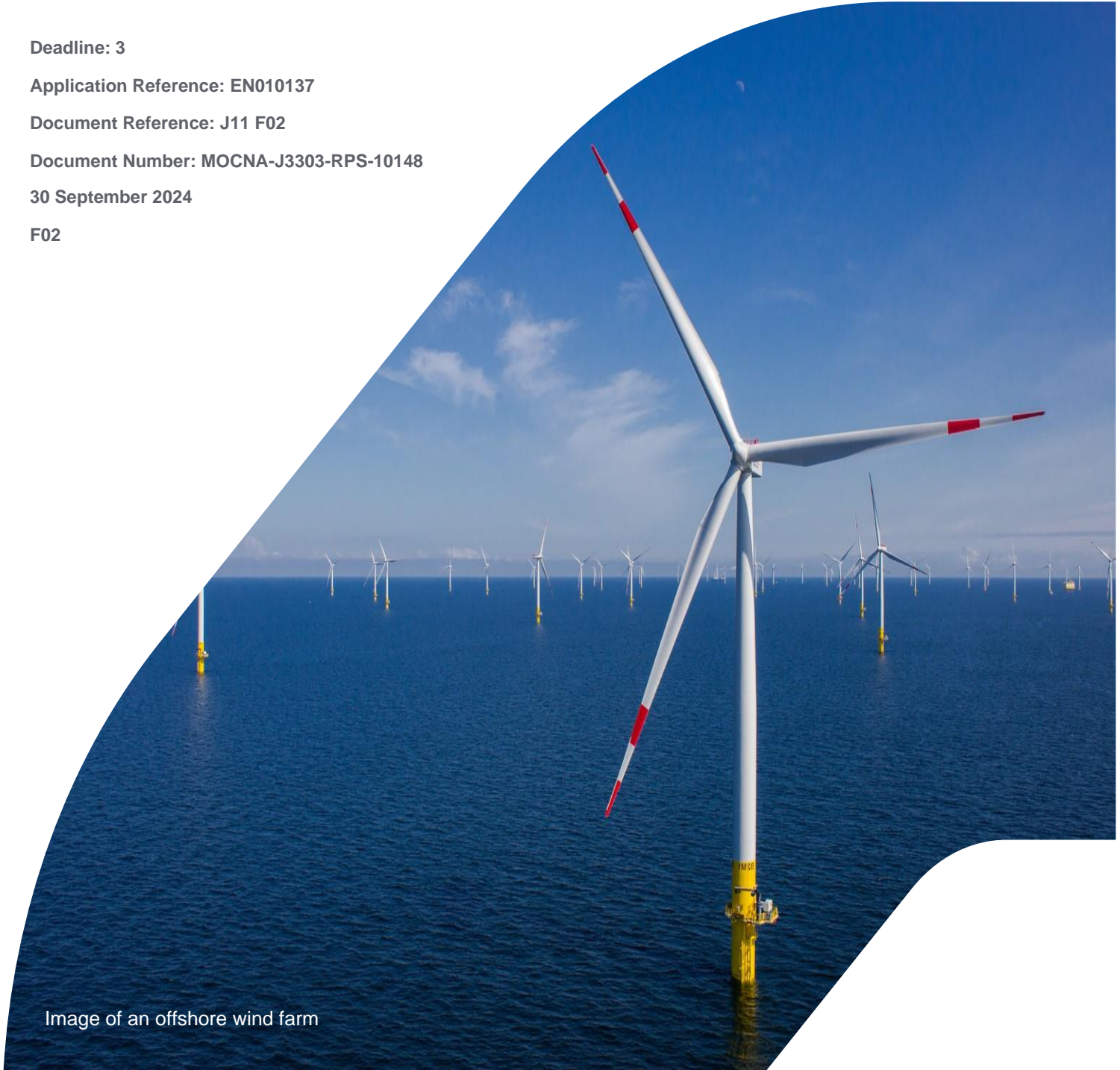
Image of an offshore wind farm